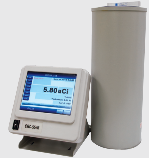
CRC®-55tR Dose Calibrator