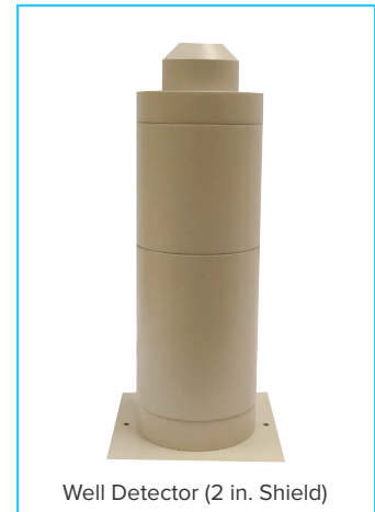
Well Detector (2 in. Shield)