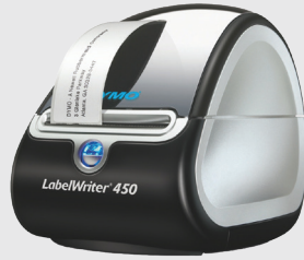
Dymo Label Writer Printer 450