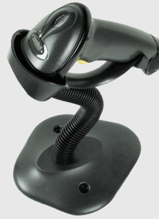
Symbol Bar Code Reader LS 2208