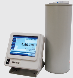
CRC®-55tR Dose Calibrator